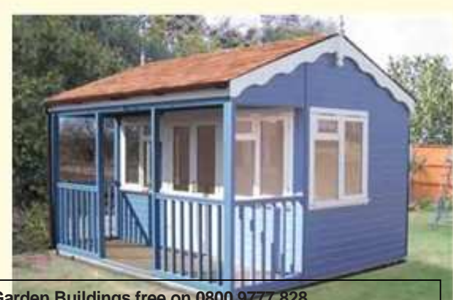
16' x 12' Garden Office 86

For expert advice phone Summer Garden Buildings free on 0800 9777 828