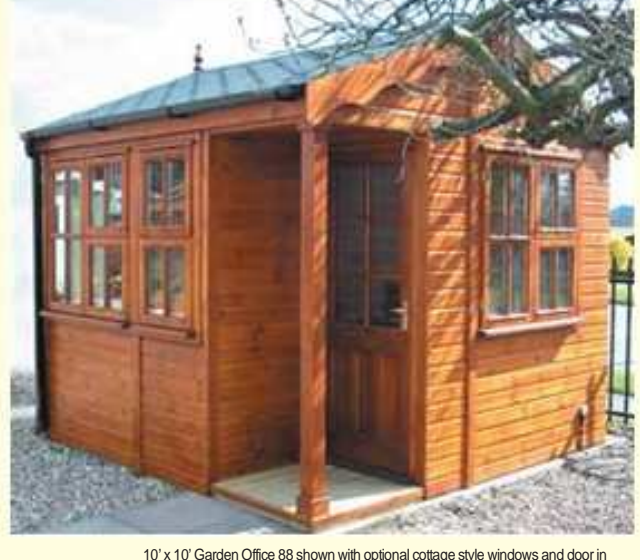
10' x 10' Garden Office 88 shown with optional cottage style windows and door in standard oak finish

Prior to delivery it is treated with three coats of medium oak stain, should you prefer there are a range of exciting colours available to choose from.