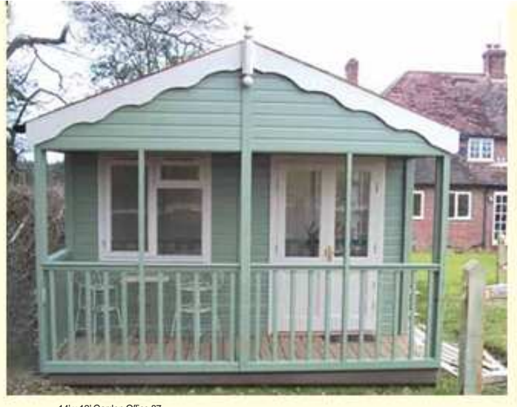
14' x 12' Garden Office 87