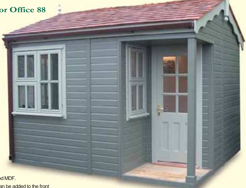
10' x 10' Garden Office 88 shown with optional cottage style windows and door.

Guttering: Guttering and downpipes can be added to the front or back of your building