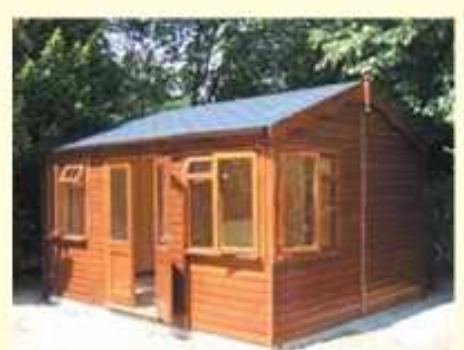
16' x 10' Garden Office 80 shown with optional double doors and in the standard medium oak colour

Guttering: Guttering and downpipes can be added to the front and back of your building.