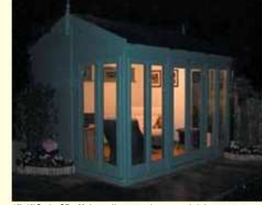
12'x 10' Garden Office 82 shown with two extra glass to ground windows

Guttering: Guttering and downpipes can be added to the front and back of your building