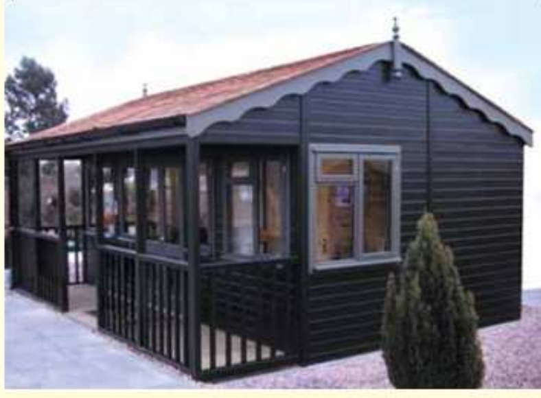
20' x 16' Garden Office 86