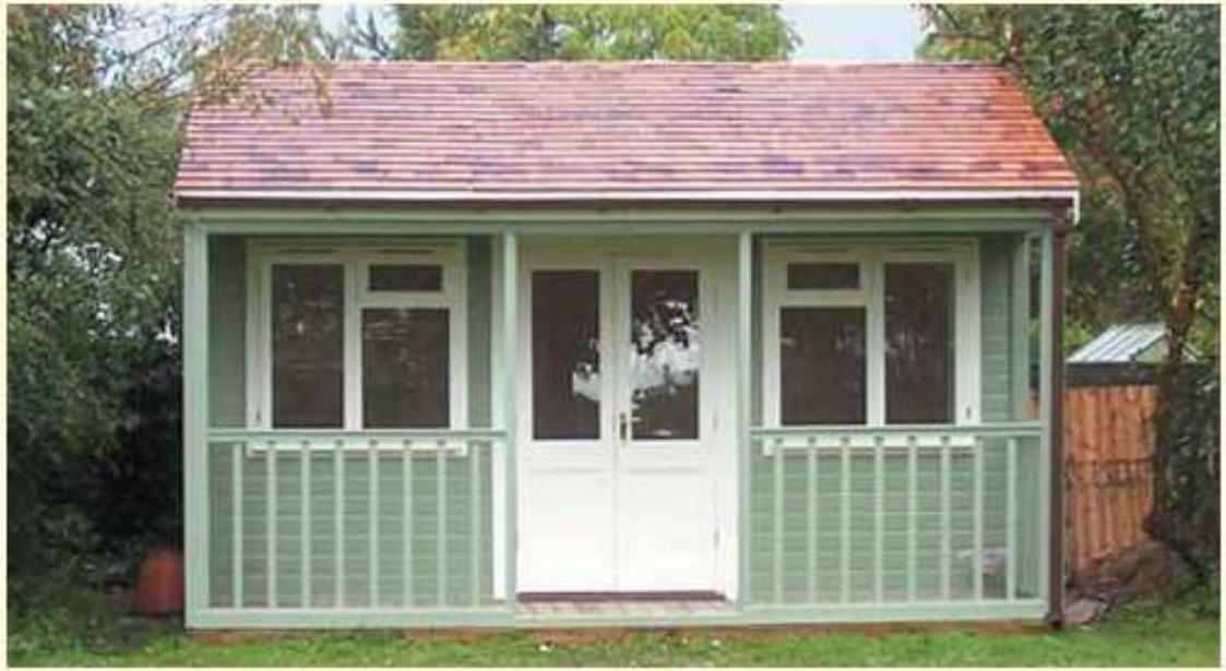
16' x 12' Garden Office 86