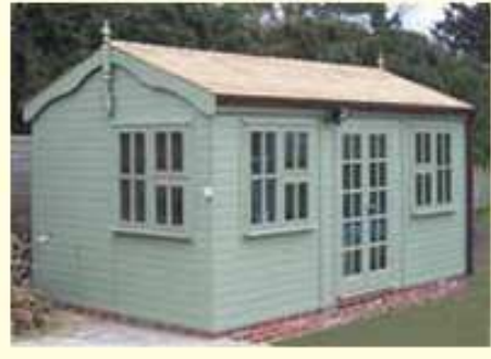
16' x 10' Garden Office 81 with cottage style windows and door

Internally these offices are fully lined and insulated making them warm and comfortable for all year round use. Prior to delivery it is treated with three coats of medium oak stain, should you prefer there are a range of exciting colours available to choose from. The roof is covered with bitumen roof tiles available in either black, red or green.