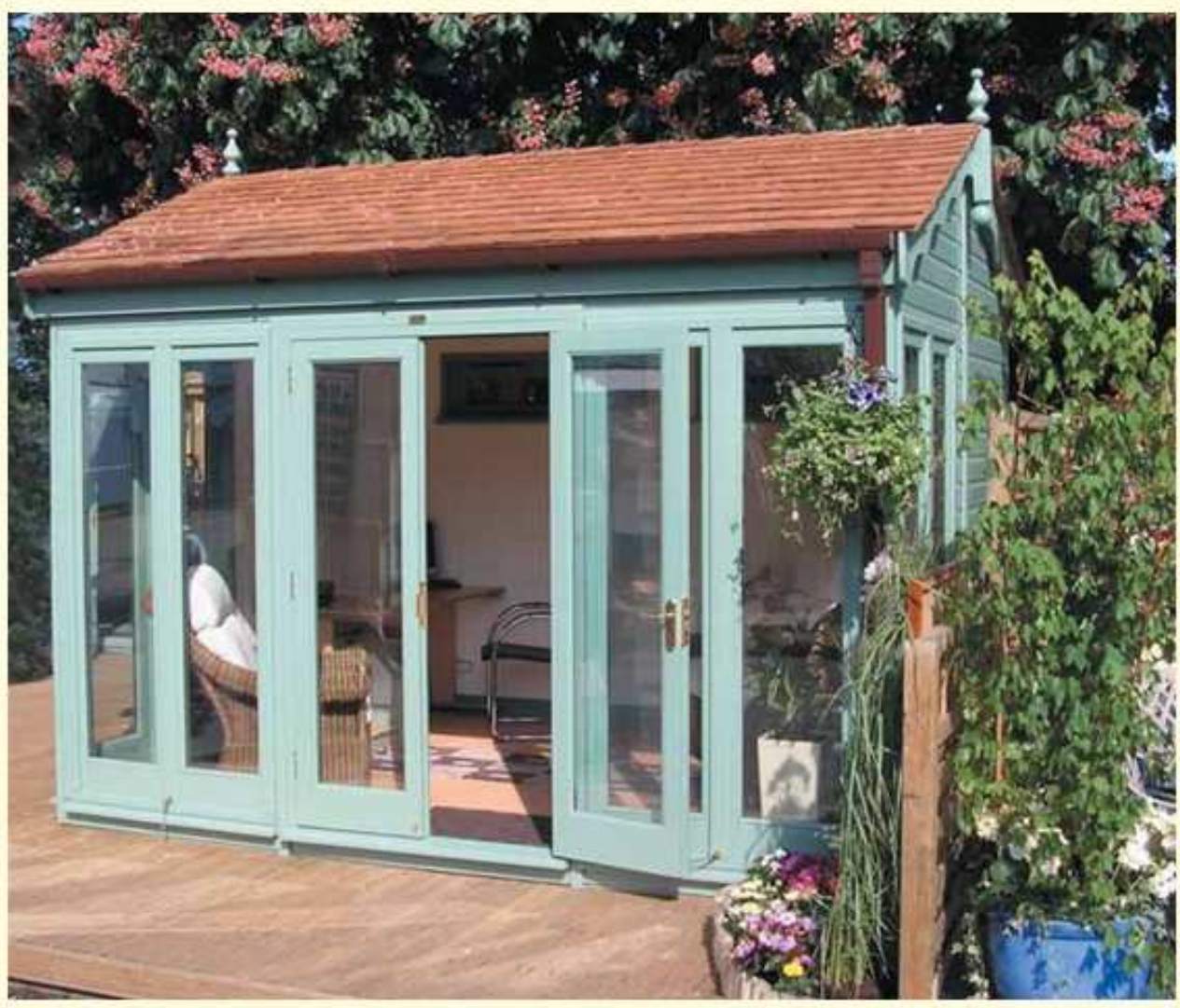
14'x 10' Garden Office 82 shown with two extra glass to ground windows

This very attractive office makes a stunning feature in any garden. The patio style glass to ground windows allow natural light to pour into the building giving you the feeling of being out in your garden all year round.