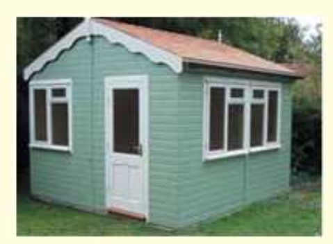
10' x 10' Garden Office 80 shown with door in gable end