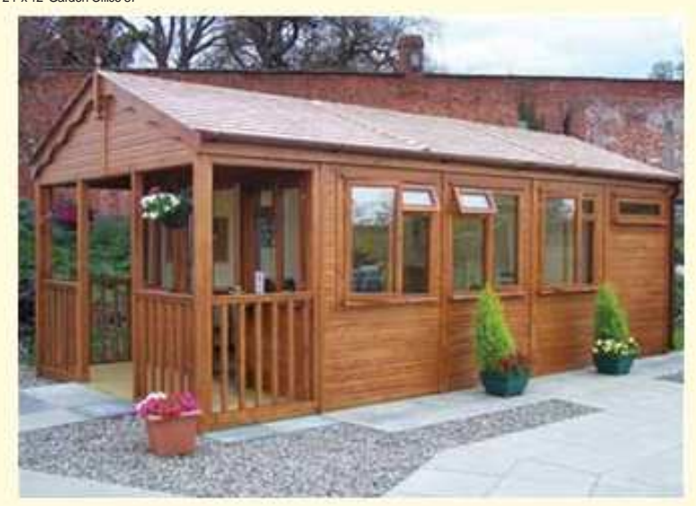
24' x 12' Garden Office 87

These traditionally styled garden rooms can be used for many purposes - business or pleasure. The integral 1200mm deep verandah provides shelter from the elements over the double door entrance and offers an extra area to out and enjoy. The verandah comes with a pressure treated decking floor. Four 1200mm x 1200mm casement/vent window half glazed double doors are included. Window and door arrangements can be positioned to suit your individual requirements. Extra windows and doors can be added if required see options below. All windows and doors are double glazed with 4mm toughened glass as standard.