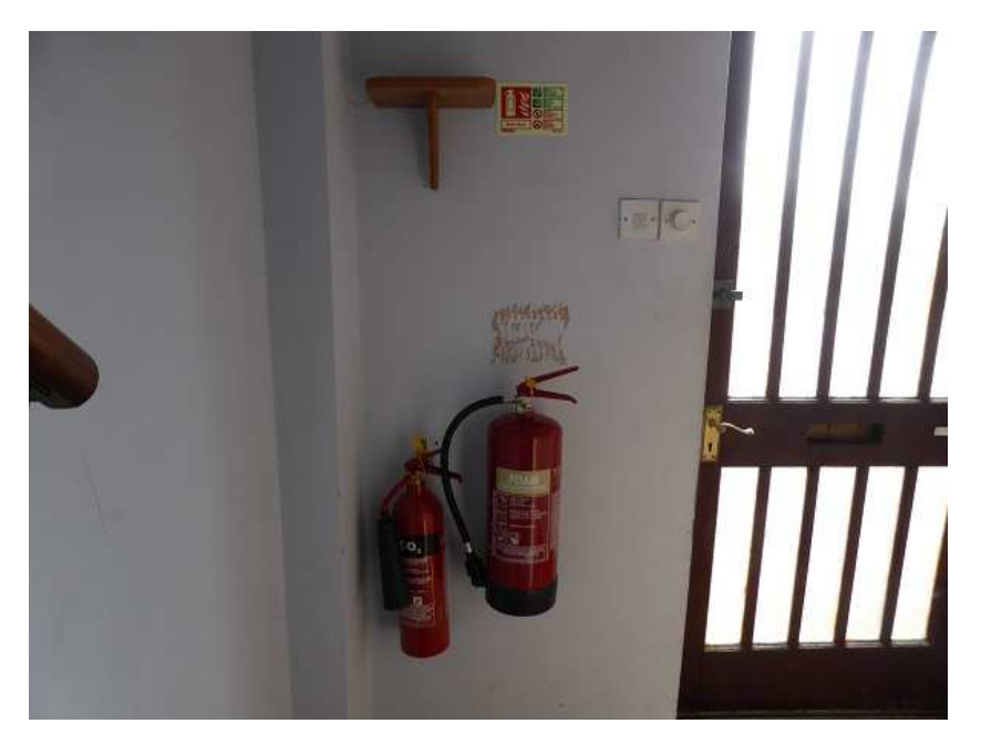
The entrance lobby and the stairs