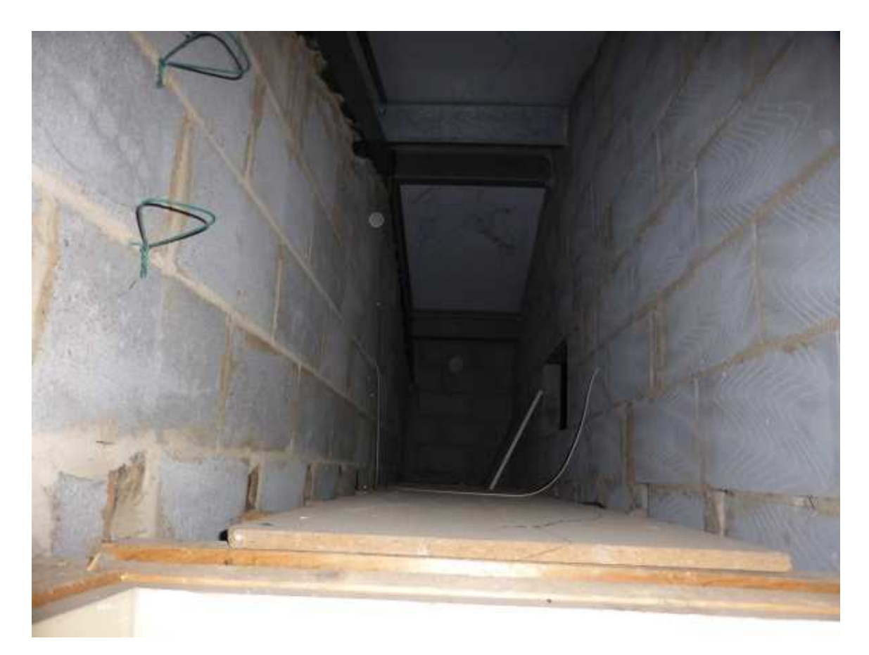
The loft area viewed in both directions