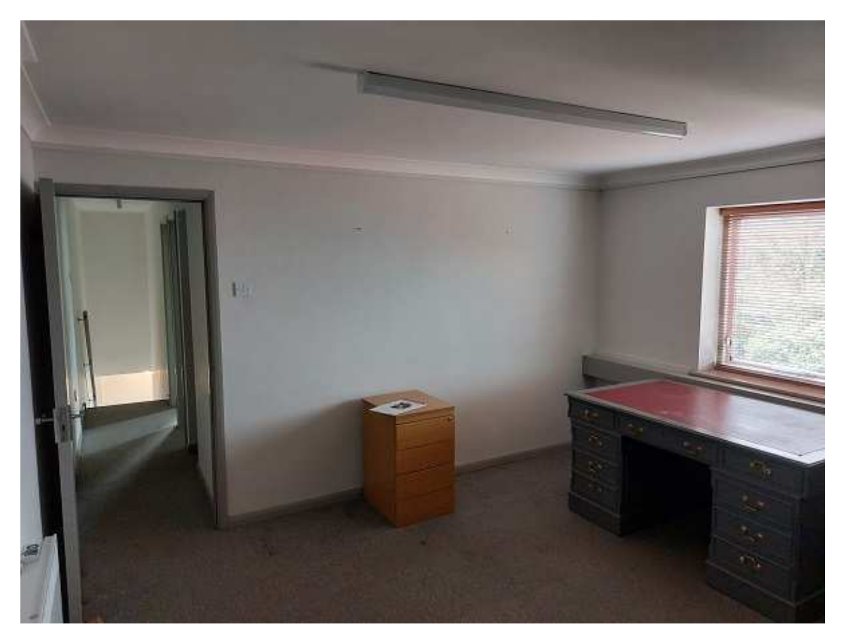
Room 3 (first foor)