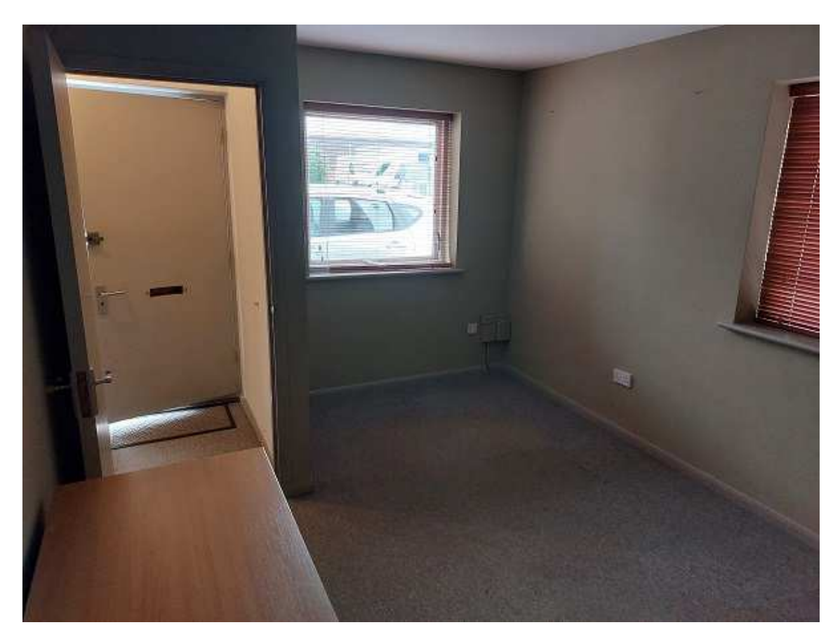
Room 1 (ground floor)