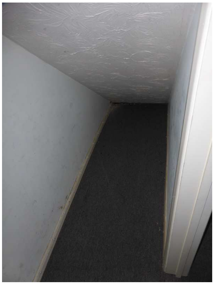
The stair cupboard (above) and the loft hatch (below)